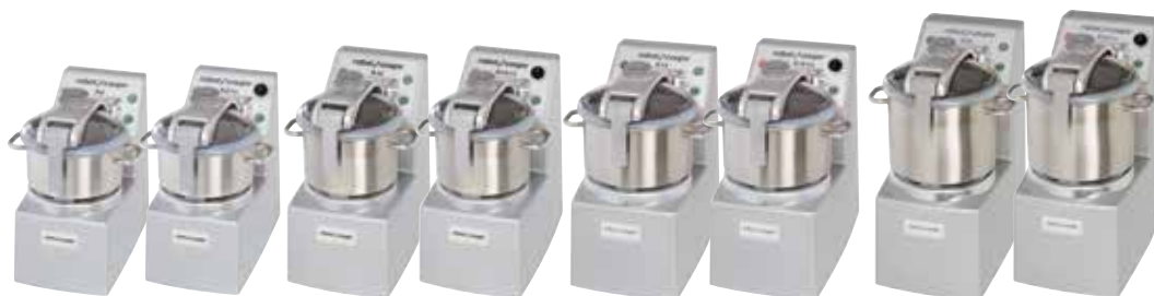
R 8 - R 8 V.V.