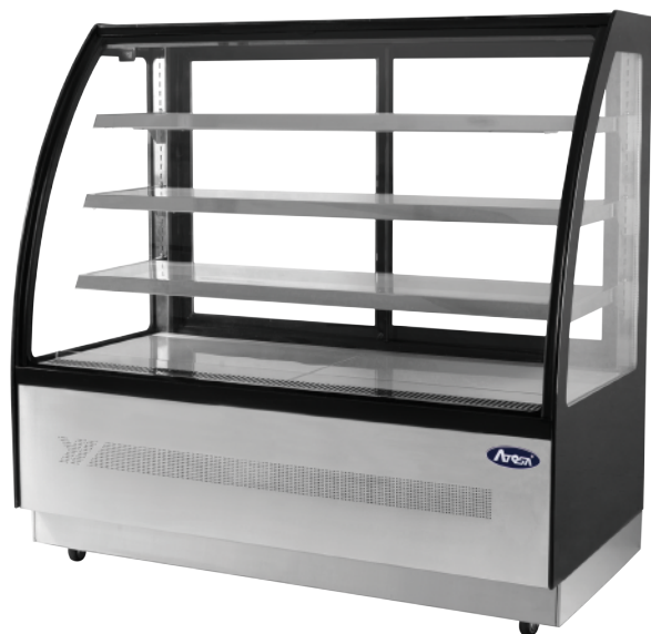
Four Tier Upright Curve Cake Showcase