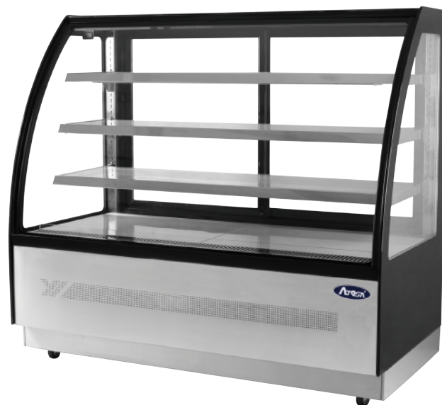
Four Tier Upright Curve Cake Showcase