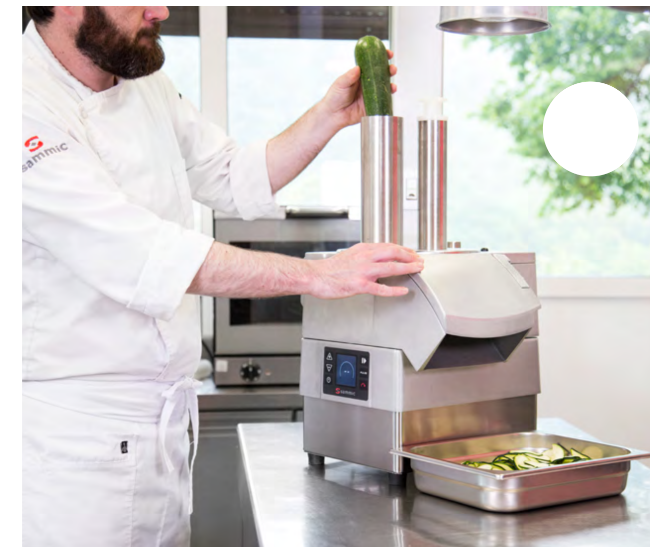
Long vegetable attachment