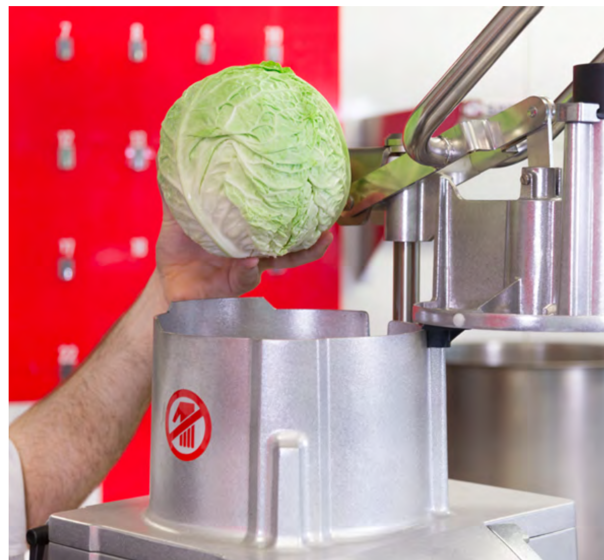
Large Capacity Attachment