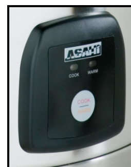
One touch controls