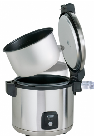
Easily removable Non-Stick Bowl